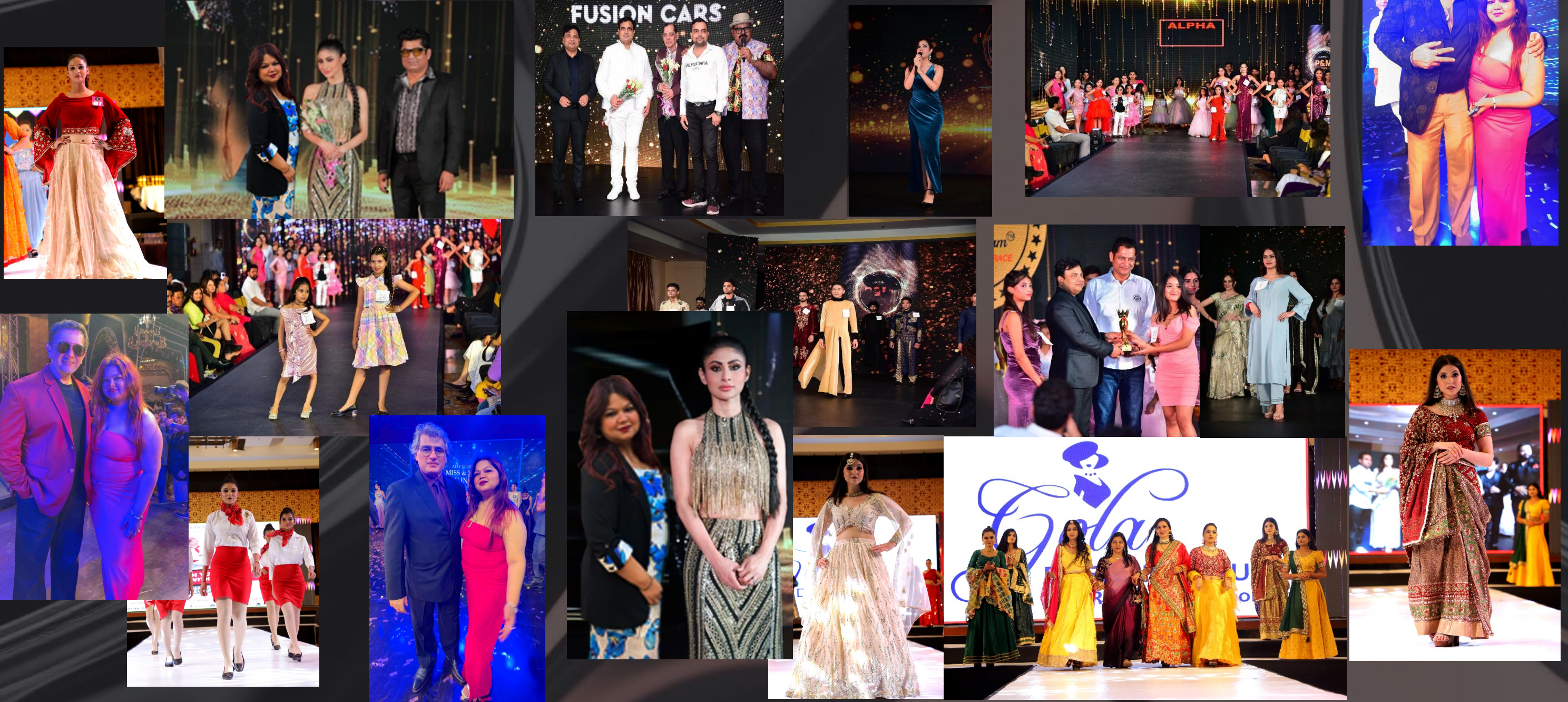
JAYPEE PALACE AT AGRA SHOW GALLERY