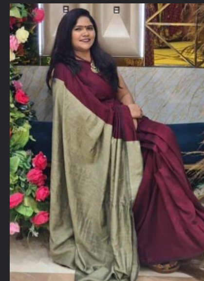
REENA CHANNEL PARTNER