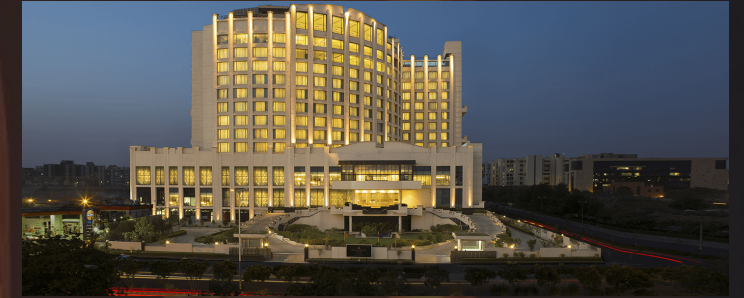
WELCOME HOTEL BY ITC

Print , Electronic, Outdoor Media, Kiosks, influencers, TV & digital social media platforms across India.