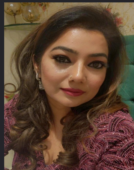
MEENAKSHI CHANNEL PARTNER